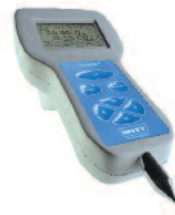
OXYBABY® O 2 /CO 2

Of course, WITT is certified according to ISO 22000. This international standard specifies a food safety system. By external quality audits this certification is periodically approved and renewed. This offers you guaranteed safety you can trust.