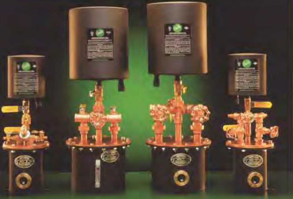
Model "69" Model "L" Model "S" Model "70"

All Gasfluxers can be easily maintained, regulated, and refilled by one operator.